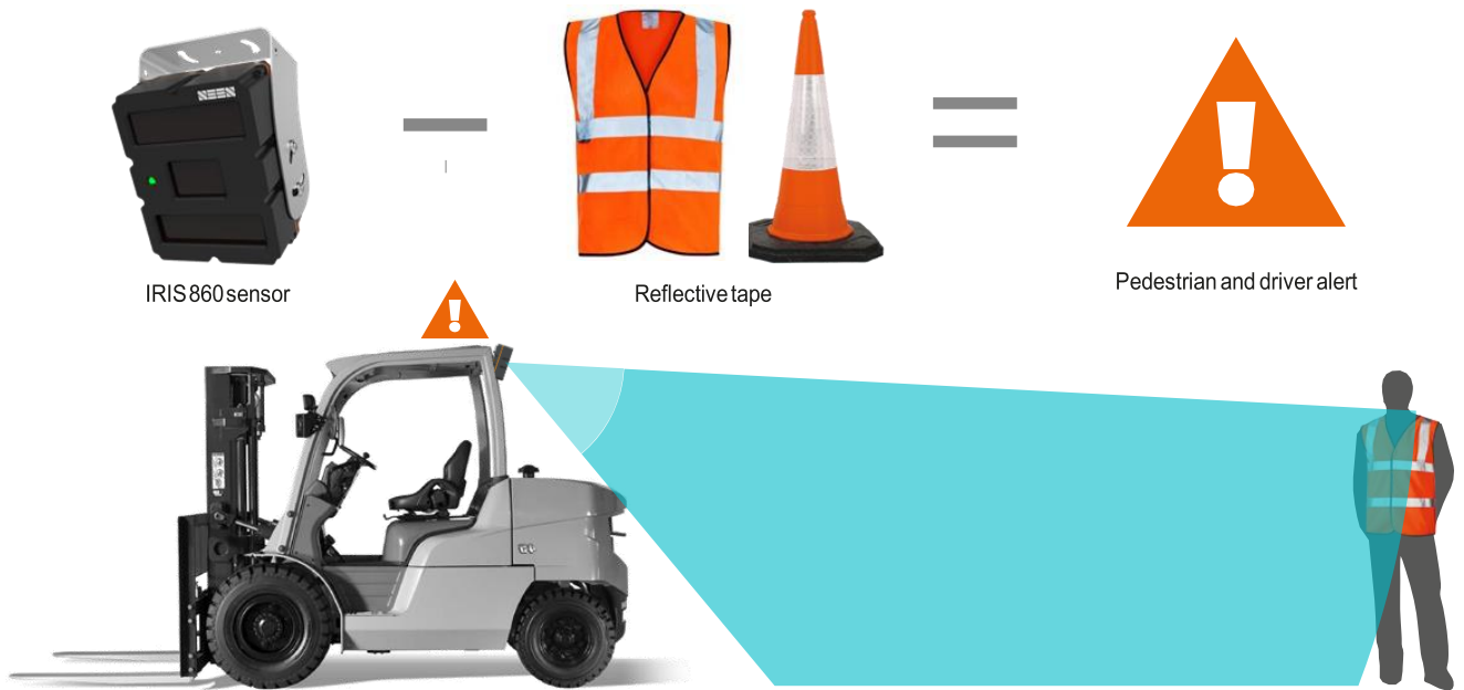
IRIS 860 sensor

SEEN's IRIS 860 sensor detects reflective tape on high-vis PPE and markers, enabling simple and effective active detection, with virtually zero operational impact and no on-going cost. See how at www.seensafety.com